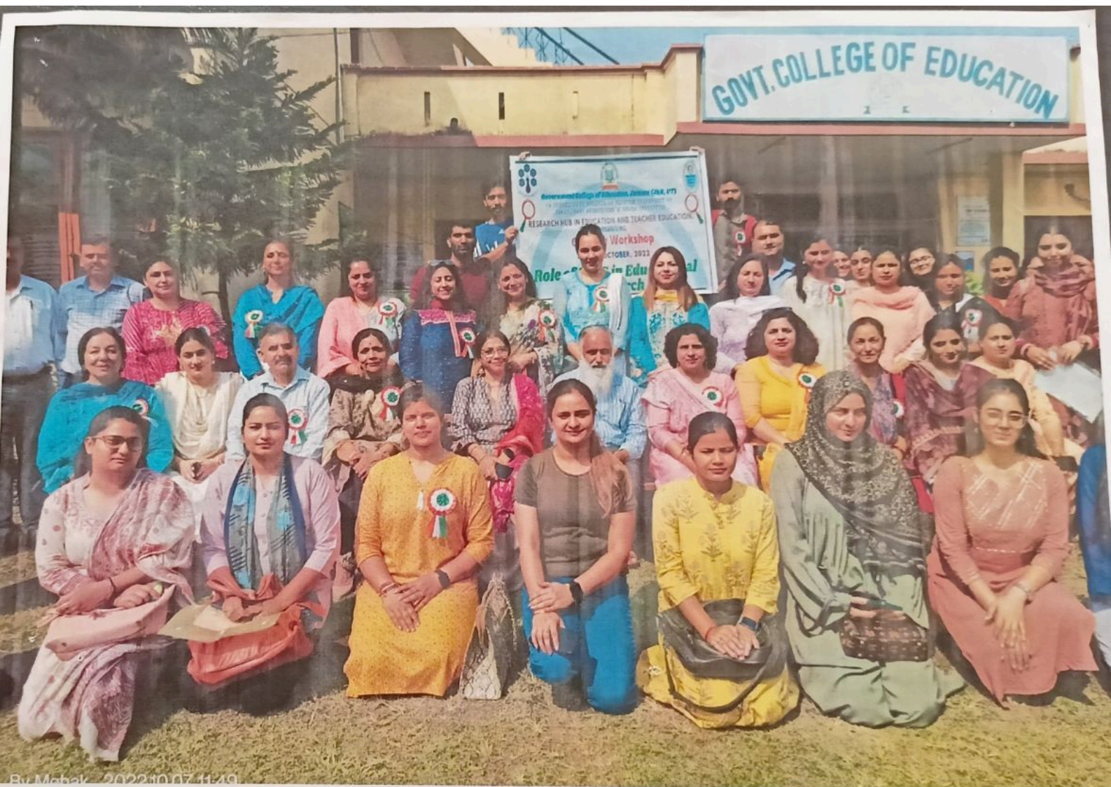
By: Mubarak 2022/10/07 11:49