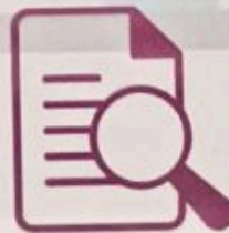
Research Hub Committee